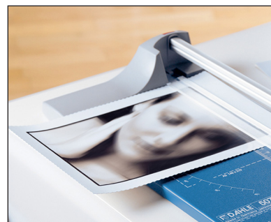
Automatic clamp holds work securely and prevents shifting while trimming.