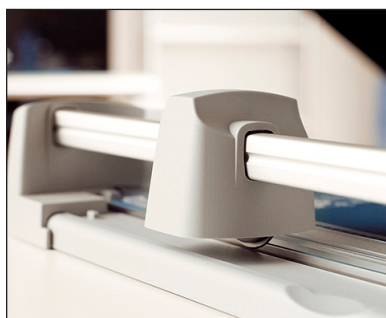
Features a ground self-sharpening rotary blade that cuts in either direction.