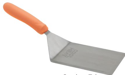
Cutting Edge Hoja Cortante 6" x 5" | TNH-63