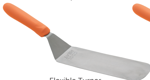
Flexible Turner Volteador Flexible 8-1/4" x 2-7/8" | TNH-90