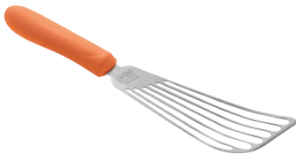
Fish Spatula Espátula para Pescado 6-3/4" x 3-1/4" | TNH-60