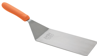
Burger Turner Volteador de Hamburguesas 5-1/8" x 2-7/8" | TNH-61