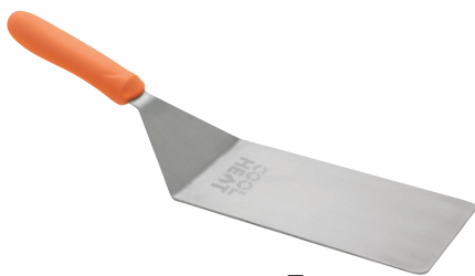
Turner Volteador 8" x 4" | TNH-42