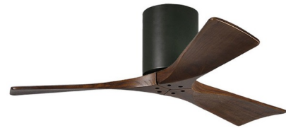
Shown in matte black / walnut tone

The Atlas Irene Hugger Ceiling Fan is rustic yet strikingly modern, with cleanly joined solid wood blades and a minimal cylindrical motor housing. Its streamlined profile with the warm, natural look of wood works beautifully in contemporary and transitional spaces. Equipped with a DC motor, the fan is energy efficient and ultra-quiet. A hand-held remote control and wall control are included, both able to turn the motor on/off and set 6 speeds and forward/reverse. For fans that have a light, the controls also turn the light on/off and dims it. Fans that have a light include a cap matching the housing finish for no-light use. Note: Some combinations of motor finish, blade color, and light option are not available. The 72 inch is available in a 3-blade only and is not available with a light option.