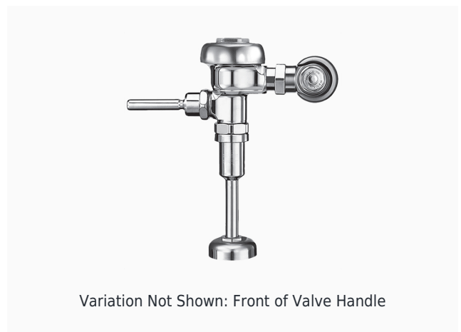
Variation Not Shown: Front of Valve Handle