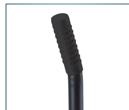
Powder-coated wringer handle with rubber grip