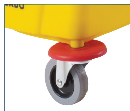
Non-marking casters with bumpers