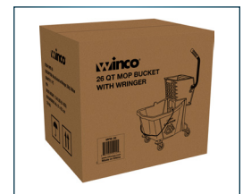
Retail packaging box