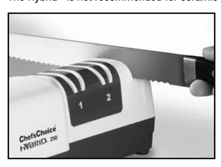
Figure 7. Serrated knife in Stage 3.

The Hybrid® is not recommended for ceramic knives.