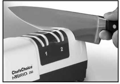
Figure 6. Knife in Stage 3. Use back and forth sharpening strokes with modest downward pressure. See text.