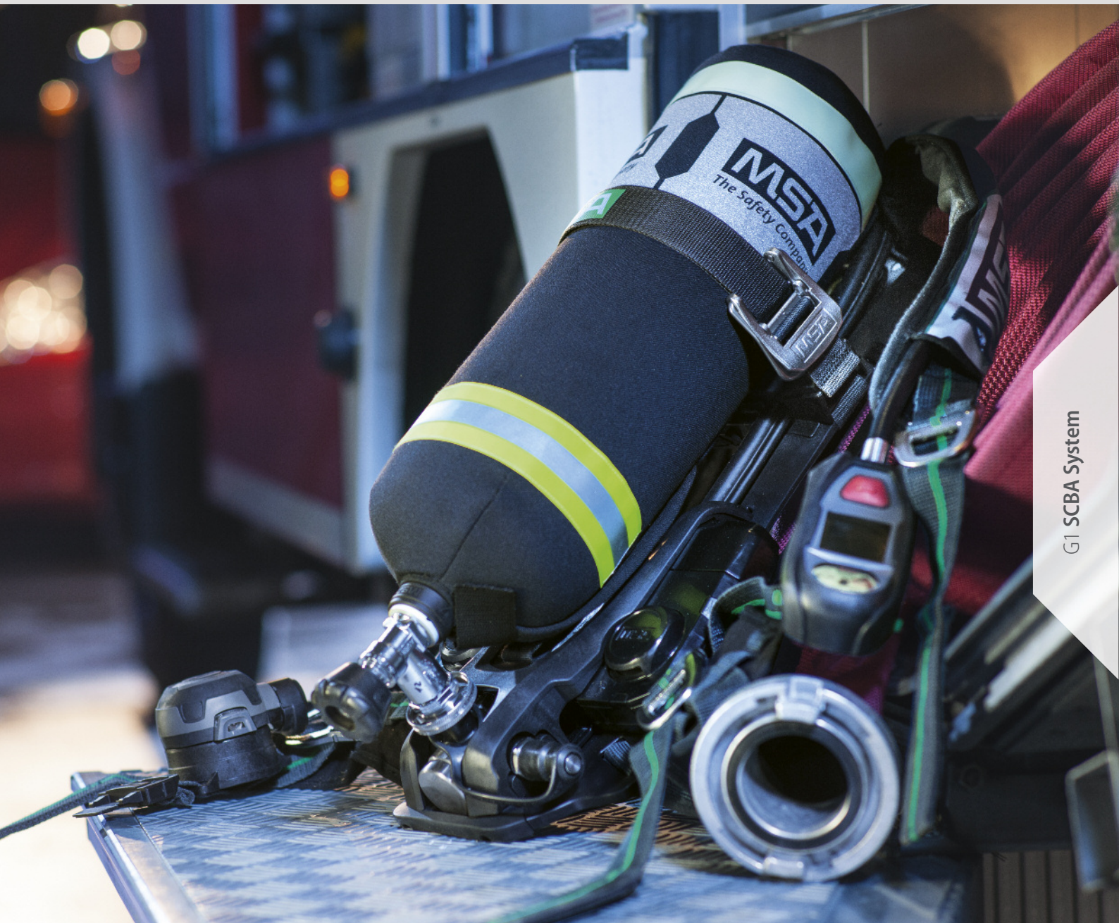
G1 SCBA System