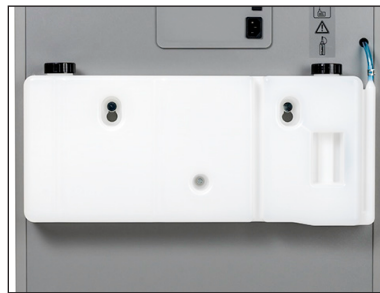
The 1 gallon EvenFlow Lubricator provides continuous lubrication for peak performance.