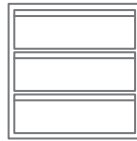
40.3" H x 18.63" D