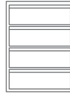
52.5" H x 18.63" D