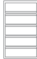
67.63" H x 18.63" D