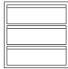
40.3" H x 18.63" D