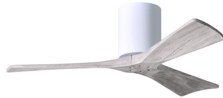
Shown in gloss white / barn wood tone

The Atlas Irene Hugger Ceiling Fan is rustic yet strikingly modern, with cleanly joined solid wood blades and a minimal cylindrical motor housing. Its streamlined profile with the warm, natural look of wood works beautifully in contemporary and transitional spaces. Equipped with a DC motor, the fan is energy efficient and ultra-quiet. A hand-held remote control and wall control are included, both able to turn the motor on/off and set 6 speeds and forward/reverse. For fans that have a light, the controls also turn the light on/off and dims it. Fans that have a light include a cap matching the housing finish for no-light use. Note: Some combinations of motor finish, blade color, and light option are not available. The 72 inch is available in a 3-blade only and is not available with a light option.