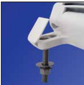
Corrosion proof, self-aligning hardware