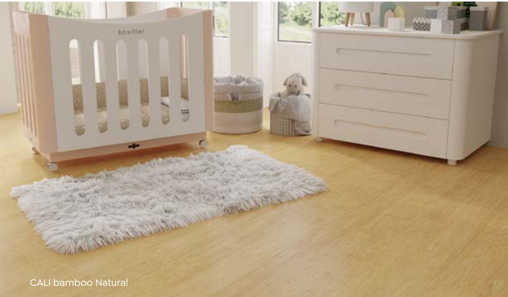
CALI bamboo Natural