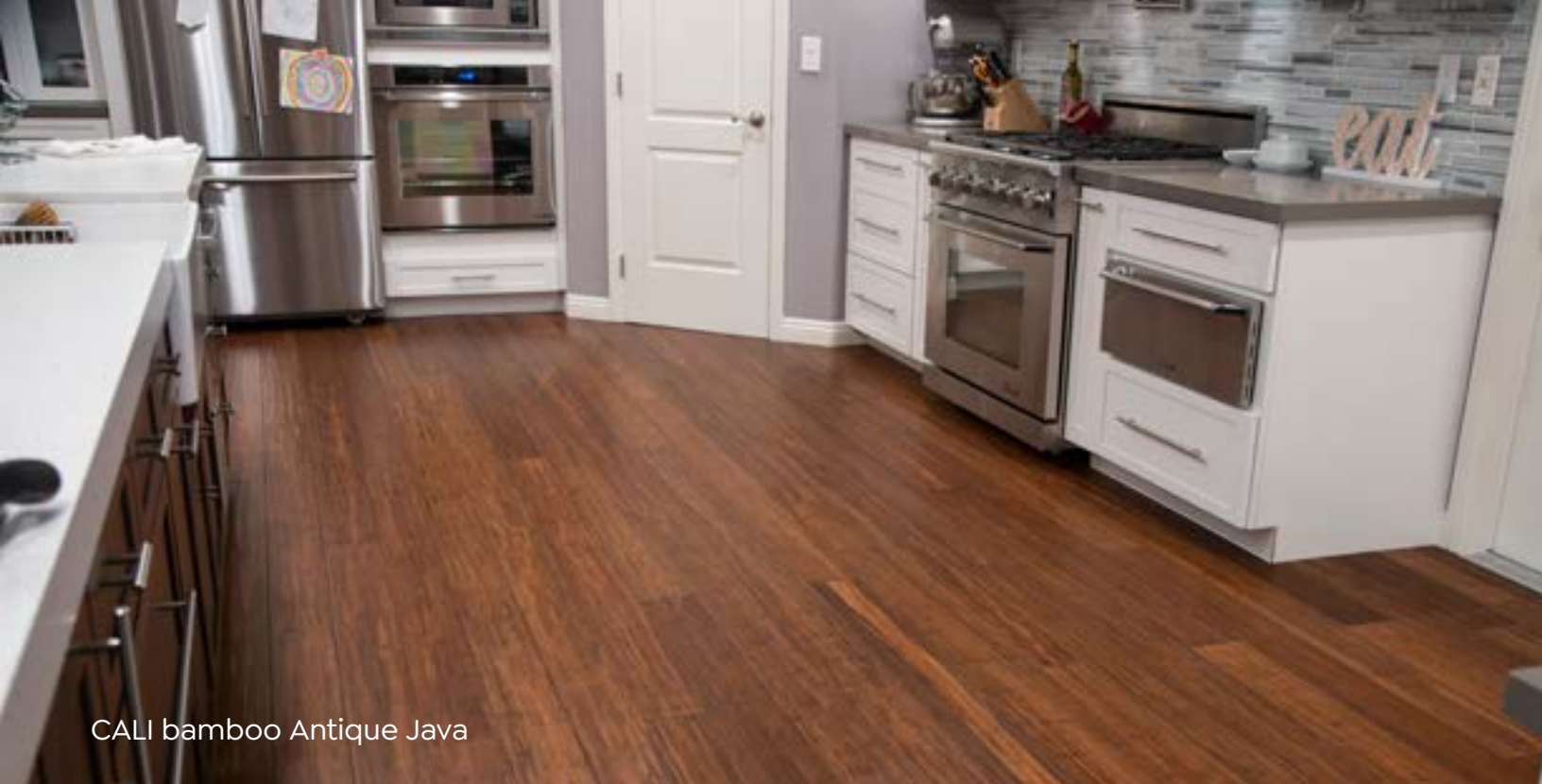
CALI bamboo Antique Java