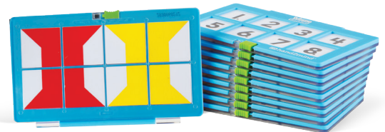
Kindergarten Answer Case