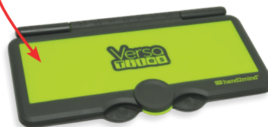
Limited Edition Answer Case