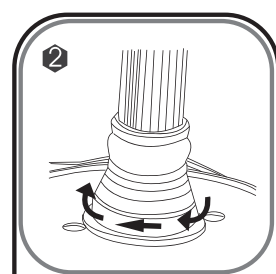
Once both pillar pieces are combined, hold them and rotate clockwise to lock pillar firmly to the base.