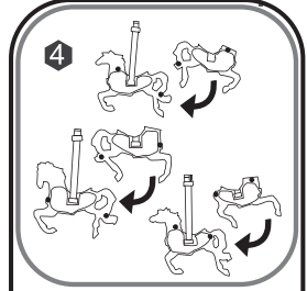
Each horse set has its own locking pin position, combine properly with poles #76, #79 and #82. Snap poles into the roof.