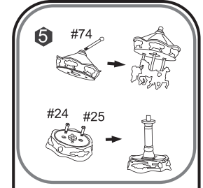
Before installing horses and pillars, tighten screws for the roof #74, and base #24 and #25. Combine the upper and lower parts to complete.