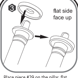
Place piece #29 on the pillar, flat side up.