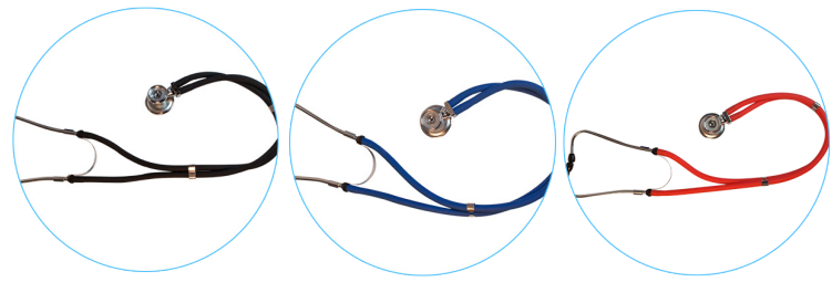
7135 - Black