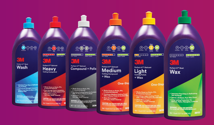
Gelcoat Finishing System Pages 3 – 7

3M has finishing families for both gelcoat and painted surfaces. This guide can help you pick the 3M system that's right for you. With the right system, our products can help you get the job done faster, with a glossier, swirl free finish.