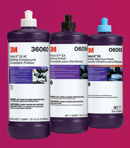
Paint Finishing System Pages 8 - 11