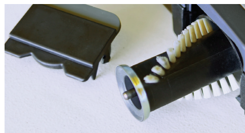
Easy Brush Removal - No Tools