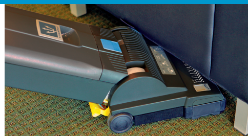
Flat-to-Floor for Easy Cleaning