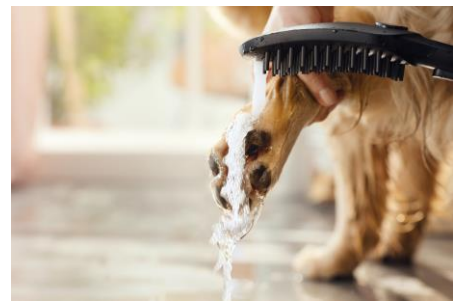
Click Here for the DogShower Digital Assets Packet