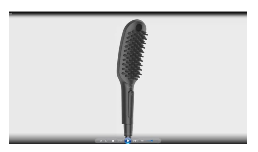
360° Product Rotation Video (15 sec)

Click Here for the DogShower Digital Assets Packet