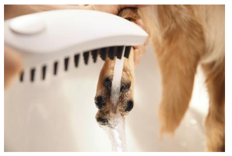
Click Here for the DogShower Digital Assets Packet