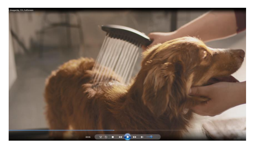
Promotional Video (15 sec)