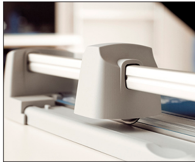
Features a ground self-sharpening rotary blade that cuts in either direction.