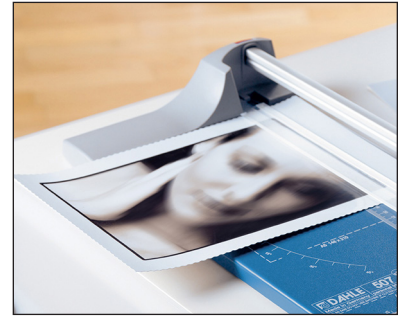
Automatic clamp holds work securely and prevents shifting while trimming.