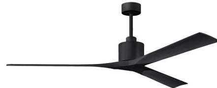
Shown in matte black / matte black