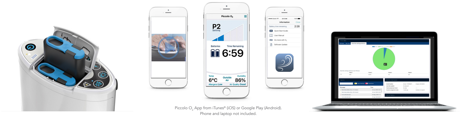
Piccolo O 2 App from iTunes® (iOS) or Google Play (Android). Phone and laptop not included.