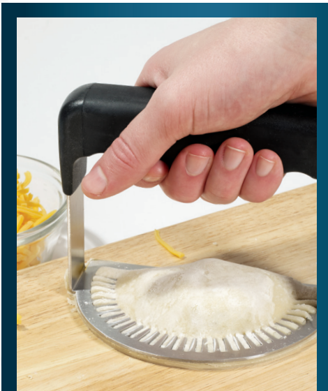
High-volume food prep solution