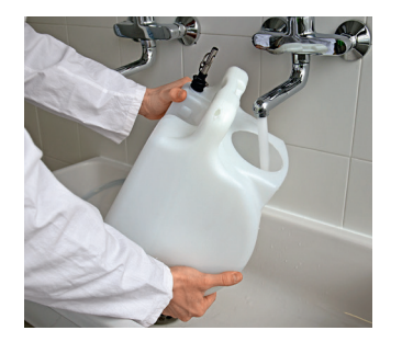
Easy-to-remove tank making pad replacement easier. simplifies refills and clean-up.