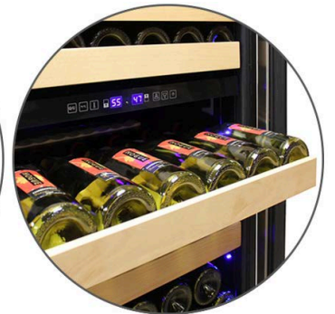
Natural Beechwood trimmed shelf