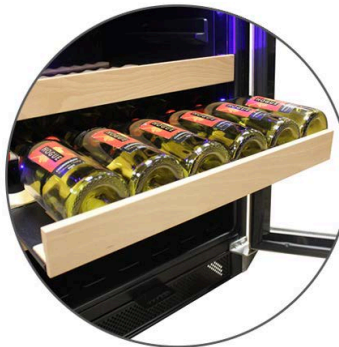
30% shelf extension