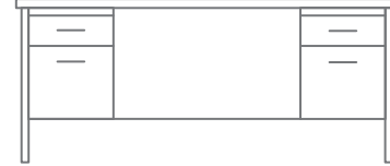
29.5" H x 72" W x 24" D