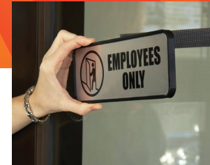
Secure plastic signs to window glass.

3M, Dual Lock and VHB are trademarks of 3M Company. Used under license in Canada. Please recycle. Printed in USA. © 3M 2023. All rights reserved. 70-0709-4083-1 (Rev4 2023)