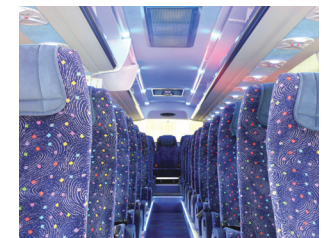
Fasten ceiling panels to interior for future access.