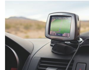
Anchor vehicle accessories to dashboard.