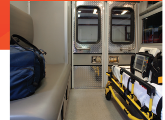
Attach cushioning panels in an ambulance or bus.