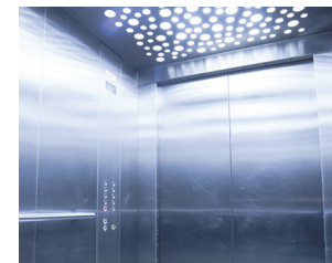
Attach elevator control panel to interior wall.