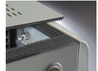
Attach access panels to industrial, electronic and electrical equipment.