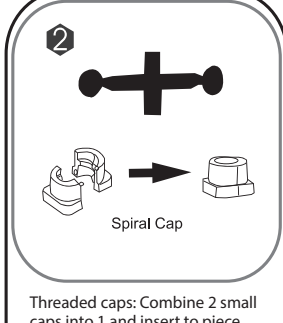
Threaded caps: Combine 2 small caps into 1 and insert to piece no.5. Eyes: Eyes are small pieces and identical for left and right. Cut small eyes from runner before installation.