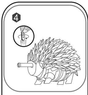
Use the center pole to lock up all pieces tightly with the included key.