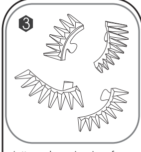
Letter mark on spine pieces for easy recognition, follow assembly order in the manual.