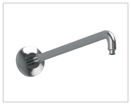
TS110MW16: Rain Shower Arm Wall Mount 16"

Please note the following components are sold separately