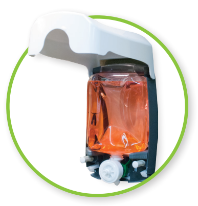
Quick Change Stay Put Cover