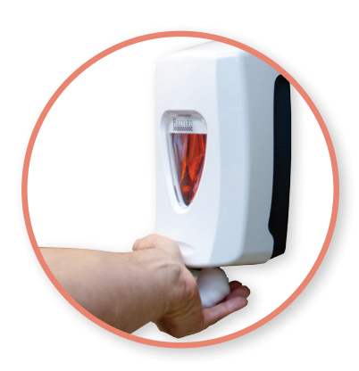
Push Cover Dispensing