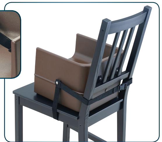
Secure to chair back and seat