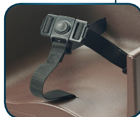
3-point center harness restraint