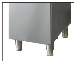
Adjustable feet optional