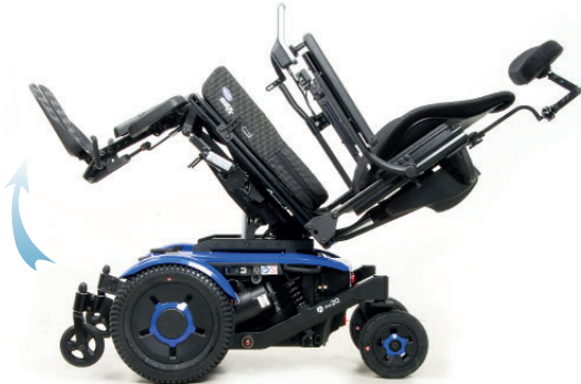
45° CG Tilt