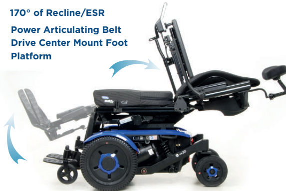
170° of Recline/ESR Power Articulating Belt Drive Center Mount Foot Platform