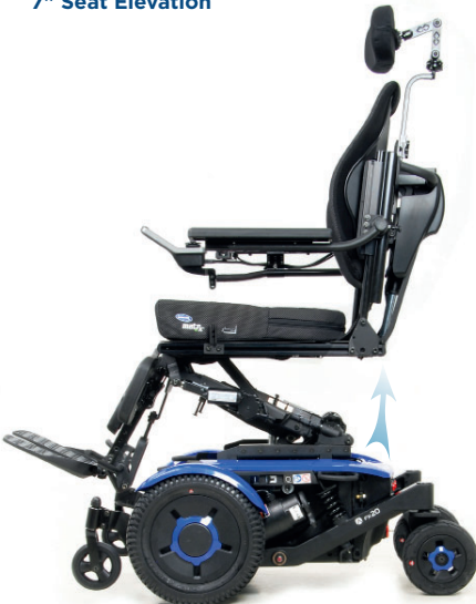
7" Seat Elevation