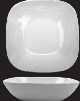
SB-410-UM 3 ea.