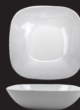
SB-182-UM Square Bowl 5.7 qt. 13" length 3.5" deep 3 ea.