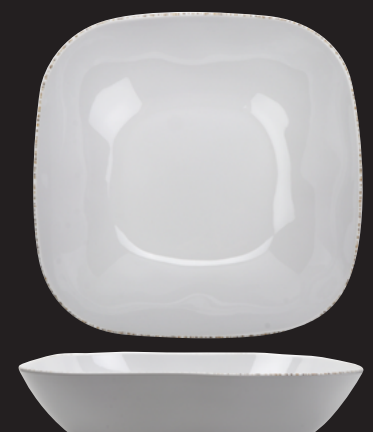
Square Bowl 12.8 qt. 16.75" length 4.5" deep