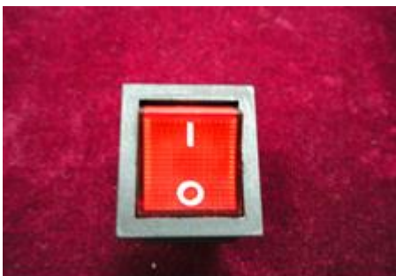
81004 On/Off Switch