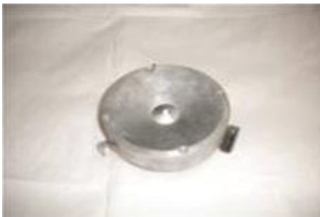
81001 Heating Head