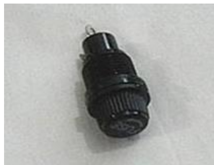
81008 Fuse Socket