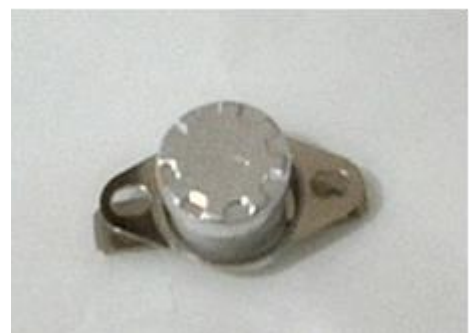
81010 Temperature Limiter