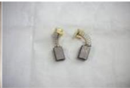
81002 Electrical Brush