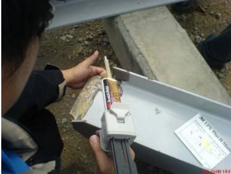
Figure 4: handheld 3M™ EPX™ Plus II applicator containing a duo-pak cartridge with attached static mix nozzle.

mixing, or may come in small cans or tubes which require manual measuring and mixing of the parts. The two-part 3M™ EPX™ Duo-Pak system features two side-by-side cylinders appropriately sized to provide the right mix ratio, and disposable static mix nozzles that ensure proper mixing in use. A variety of hand-held applicators are available as well (see picture below).