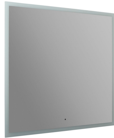
Shown in black / mirror

COLOR RENDERING . . . . . 85 CRI LAMP COLOR . . . . . Tunable White LUMENS/WATT . . . . . 46.29 LUMINOUS FLUX . . . . . 3120 lumens