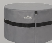
OPTIONAL UV PROTECTED FITTED COVER