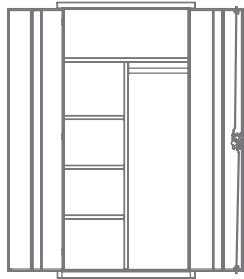
72" H x 36" W x 18" D