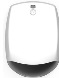
with photocell (white)