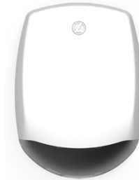
without photocell (white)