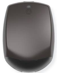
with photocell (dark bronze)