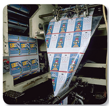
3M^{^{\intercal}} UHMW-PE Tape 5423 is placed on a web former edge to minimise web friction as the web is folded.