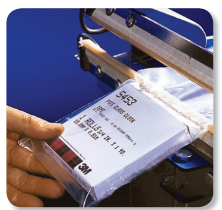
In heat sealing operations 3M^{\text{TM}} PTFE Glass Cloth Tape 5453 helps protect the bar underneath where the hot wire seals the plastic film.