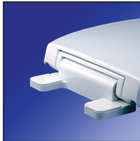
Factory-installed "living" hinge covers w/stainless steel screws