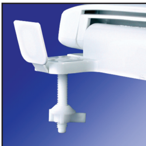
Corrosion proof, self-aligning hardware