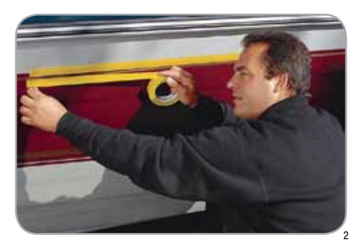
Creating long, straight paint lines is easy.