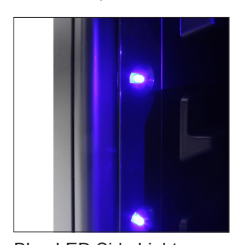
Blue LED Side Lights