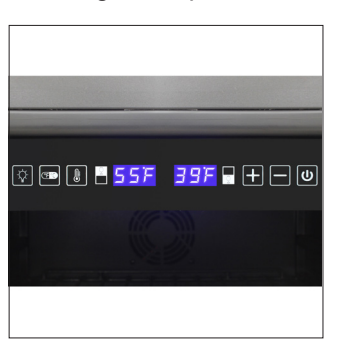
Digital Control Panel