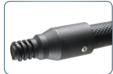
Thread onto broom head for secure fit