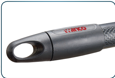
Large hanging hole