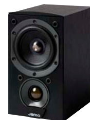
Soundwise, IW 606 FG is comparable with C 601