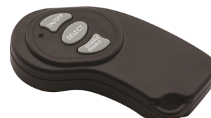
DCR: DTL CONNECT REMOTE