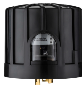
DCC: DTL CONNECT CONTROL

Remote controlled locking type photocontrol