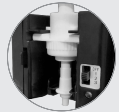
LIQUID / GEL