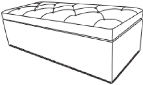
OTTOMAN QTY 1