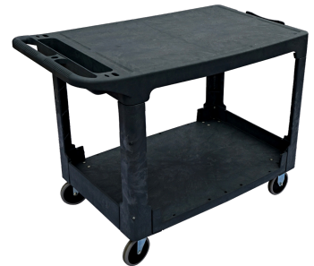
Large Flat U-Cart