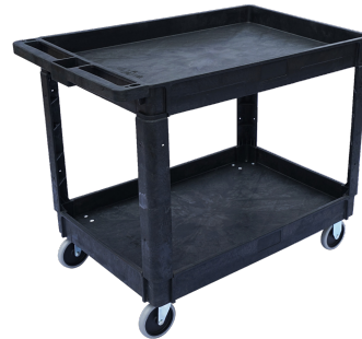
Large Lipped Cart