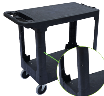
Small Flat U-Cart With Adjustable Legs