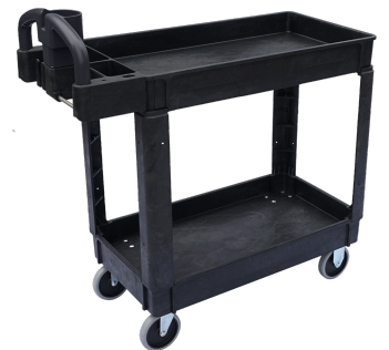
Small Lipped U-Cart With Ergonomical Handle