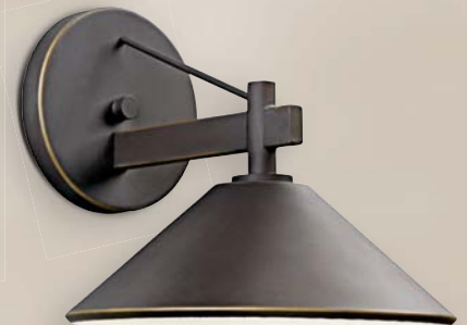
E 49060 OZ