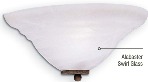
G 6930 : OB