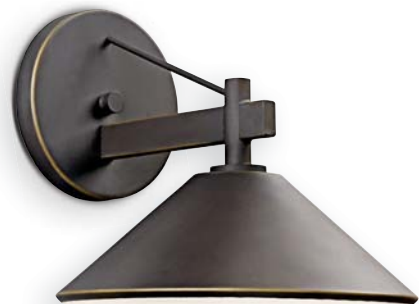
H 49060 : OZ Ripley™ : Indoor/Outdoor