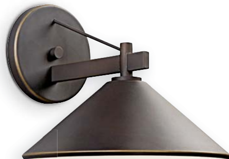
K 49061 : OZ Ripley™ : Indoor/Outdoor