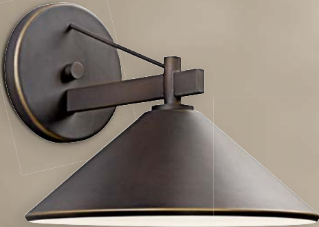
A 49061 OZ

See pages 704-705 for our complete selection of Posts and Pedestal Mount Adaptors.