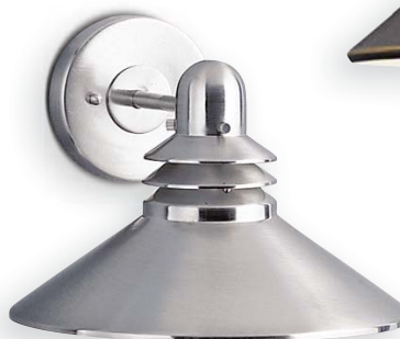
L 9044 : NI, OB Grenoble™ : Indoor/Outdoor