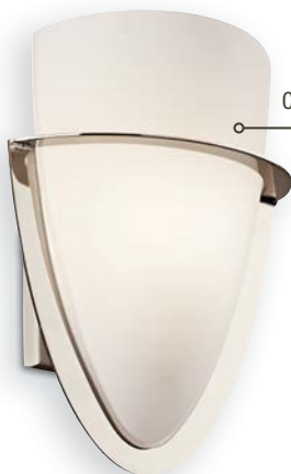
F 6020 : PN ADA Compliant