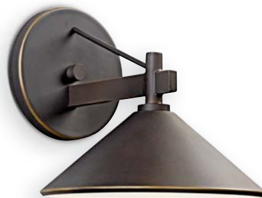
J 49059 : OZ Ripley™ : Indoor/Outdoor