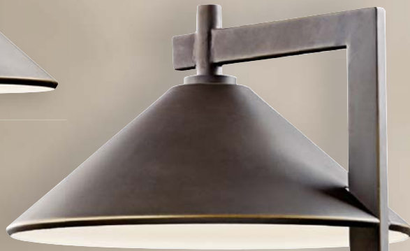
B 49063 OZ NOT TO SCALE

Shown with Architectural Bronze™ Post, 9506 AZ