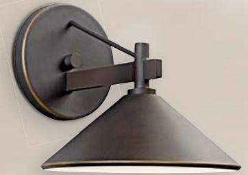
C 49059 OZ

Shown with Architectural Bronze™ Post, 9506 AZ