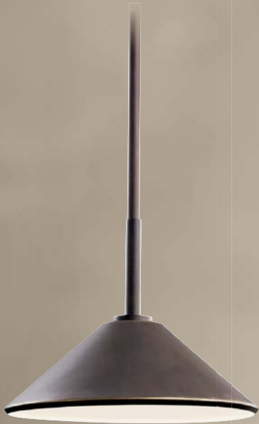
D 49062 OZ